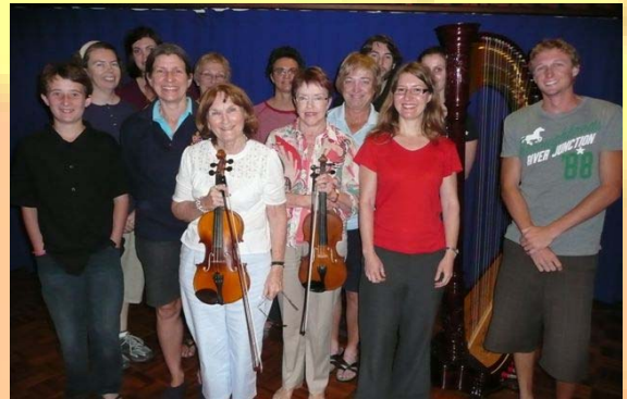
Voila! THE NEPTUNE PRODUCTIONS PHILHARMONIC ORCHESTRA